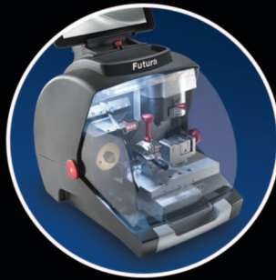
Futura Electronic Key Machine