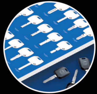
2 x MH Keyboards with full set of keys