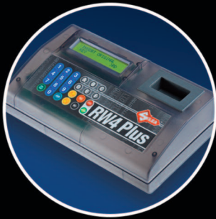
RW4+ Transponder Device Kit